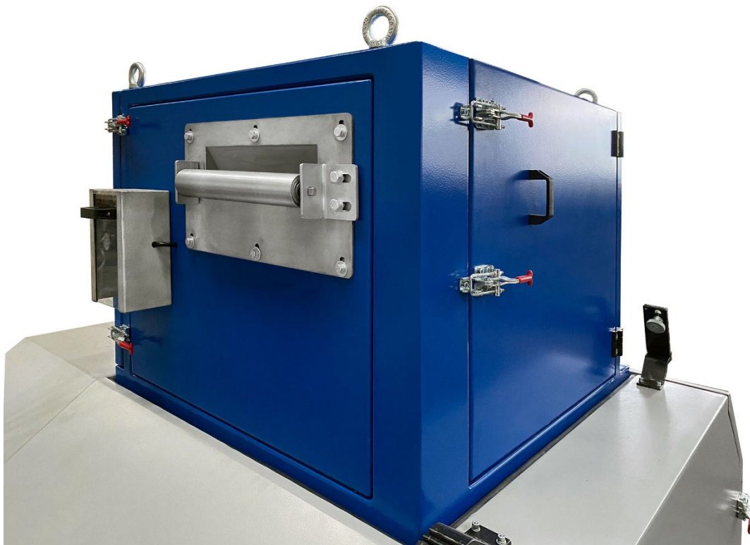
Image: Noise-insulated hopper with feed and roller infeed for edge strips